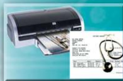
Direct Patient Result Reporting