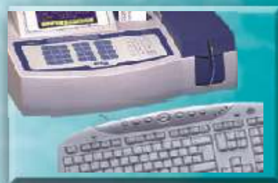
PC Keyboard Interface