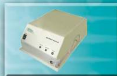
Battery Backup Unit