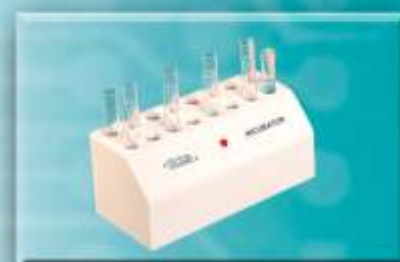
16 Position Dry Block Incubator